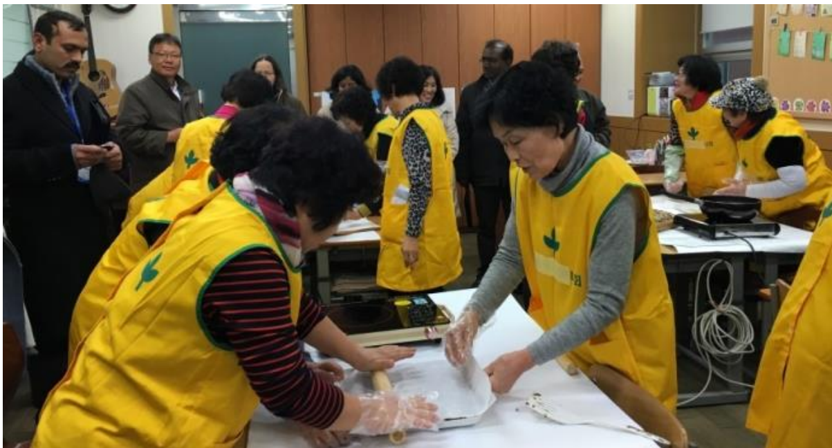
► Participants making traditional Korean grain-seed crackers during the Study Visit to Singal Night-School

Singal School was established in 1982 to provide educational opportunities to students who, for various reasons, were not able to receive an adequate education within the standard school system. It operates various educational programmes, including programmes for literacy education and General Equivalency Diploma (GED) preparation, and an income-generation programme. All the school's programmes are designed to encourage students to build self-confidence and enhance their ability to participate fully in society. Currently the school is focusing its education programmes on the older generation and foreign immigrants. Participants in the study visit observed one of the school's income-generation classes, making traditional Korean grain-seed crackers, as the school's income-generation programme is considered an example of best practice.