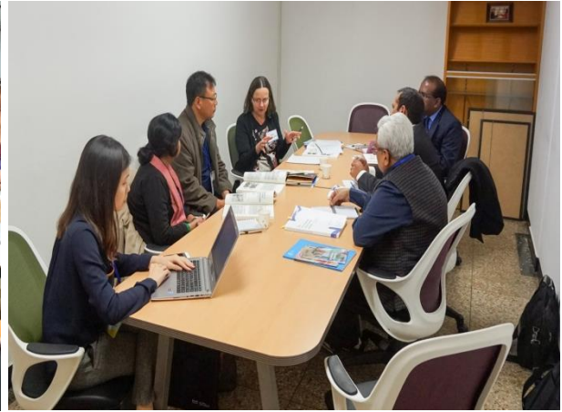
► Participants in discussion during the Sejong Literacy Project Breakout Session