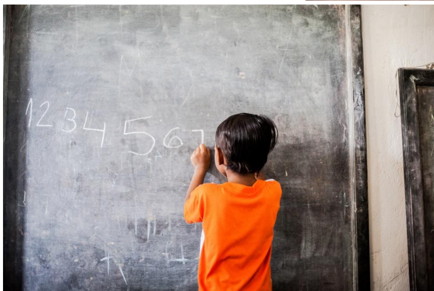
► A young boy writing numbers