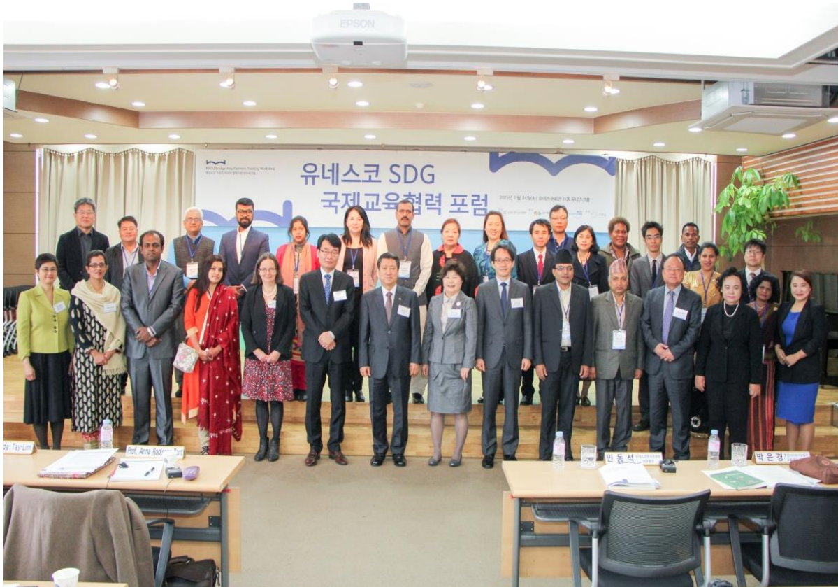
▶ The participants and KNCU Staff

Creation of the Bridge Asia Common Principles and Guidelines also took place on November 27 th . In addition, a brief awards ceremony for a photo contest organised by KNCU to celebrate International Literacy Day was held before the closing of the Workshop.