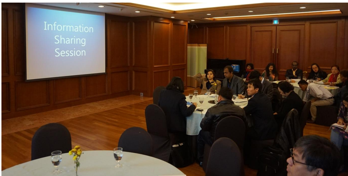
► Having face-to-face meetings during the Information Sharing Session

This session served as a forum for Bridge Asia Partners and Korean organisations conducting activities in the fields of literacy/lifelong learning and climate change to exchange information about their programmes and to discuss possible opportunities for cooperation and partnership. The participants included 23 working-level staff from Bridge Asia Partners and 11 working-level staff from seven relevant Korean organisations. The participants from each Korean organisation set up a booth with information about their organisation. At the beginning of the session, each Korean organisation gave a presentation, during which they introduced their organisation and the overseas activities they conducted, and expressed areas of interest for future operation. Following the presentations, the Bridge Asia Partners visited the booths of the Korean organisations that they were most interested in, in the limited time available during the session, for face-to-face meetings to gather more information and discuss areas of interest.