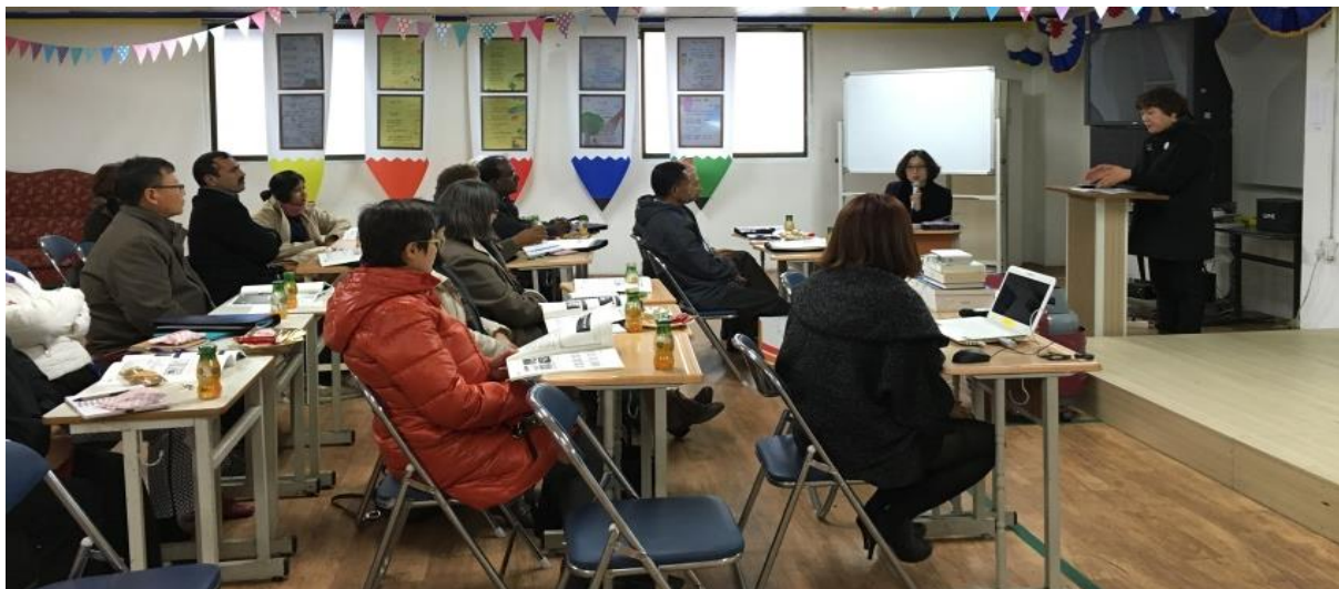
► Participants listening to introduction of the Anyang Social Education Centre during their Study Visit

Anyang Social Education Centre was established in 1996 to conduct literacy education programmes for adults from marginalised groups, with the purpose of enhancing the quality of their lives and encouraging them to participate in the building of strong communities. The centre has since expanded the range of programmes that it offers to cover far more than just literacy, and currently operates a variety of different education programmes, including adult education programmes in English and Chinese characters, study groups for teenagers, an environment preservation campaign, and volunteering programmes for communities. During the field visit, the participants observed a basic English education class that was similar to the basic literacy education programmes conducted by Bridge Asia Partners in their local areas. Participants also joined a sing-along session with the learners in the class.