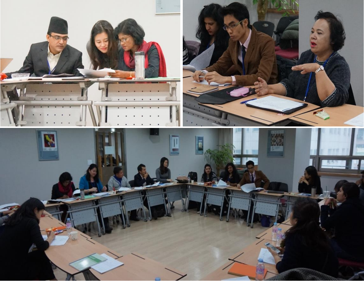
► Participants in discussion during the Climate Change Education Breakout Session