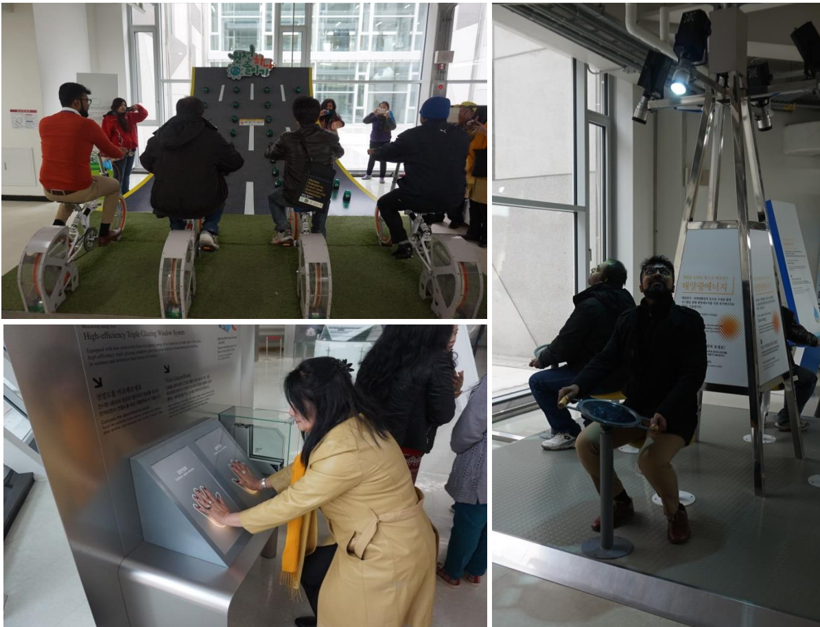
► Participants trying devices related to climate change adaptation at the Energy Dream Centre

The Seoul Energy Dream Centre is Korea's first and largest energy-autonomous building, and aims to teach the importance of energy conservation and sustainability through various programmes and experiences. During their visit the participants learned about the building itself, and more about Korea's climate change adaptation methods.