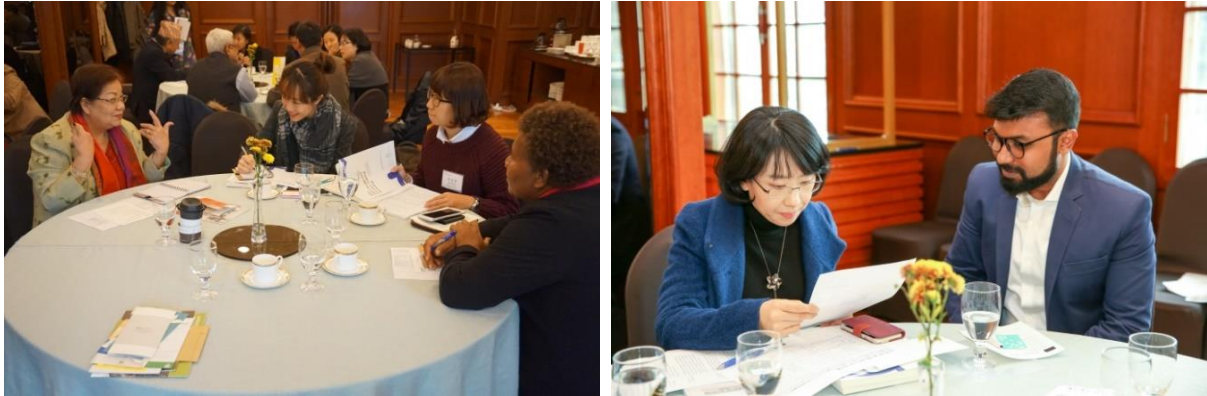
► Participants actively participating in meetings with Korean organisations

Good Neighbors and DoRunDoRun's booths were also popular, with visits from four participants each. Discussion between the Bridge Asia Partners and both these organisations showed that the Bridge Asia Partners were also interested in ways to improve financial development in the context of disaster recovery following damage caused by climate change and natural disasters. These topics were also discussed during the open discussion among Bridge Asia Partners and Korean partner organisations.