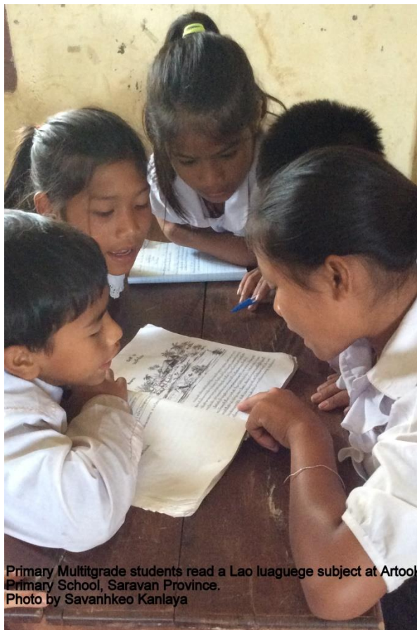
Primary Multigrade students read a Lao language subject at Artook Primary School, Saravan Province.