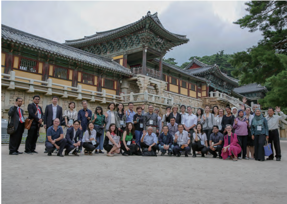
Group photo of participants at Bulguksa