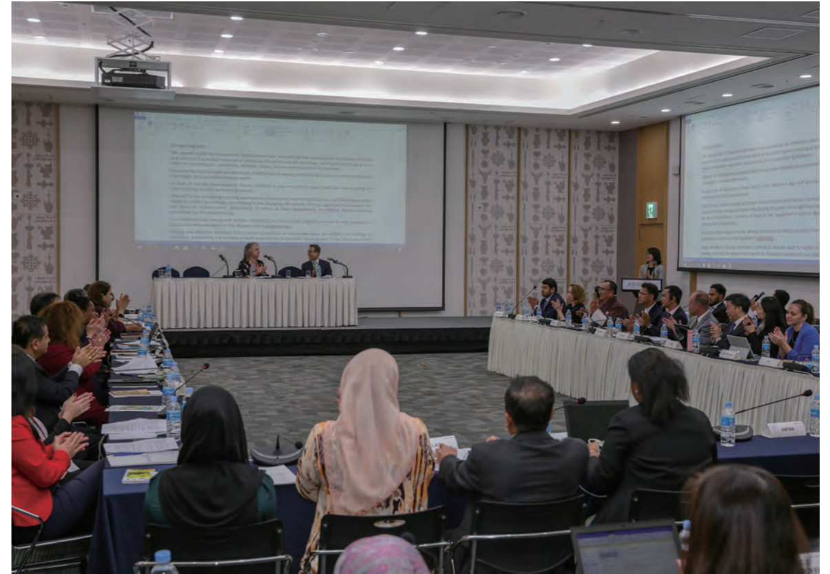
Adopting 'Gyeongju Recommendation'