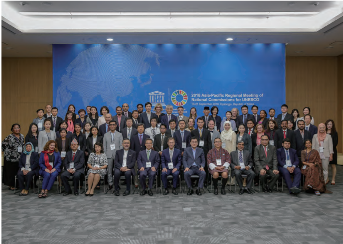
Group photo of participants