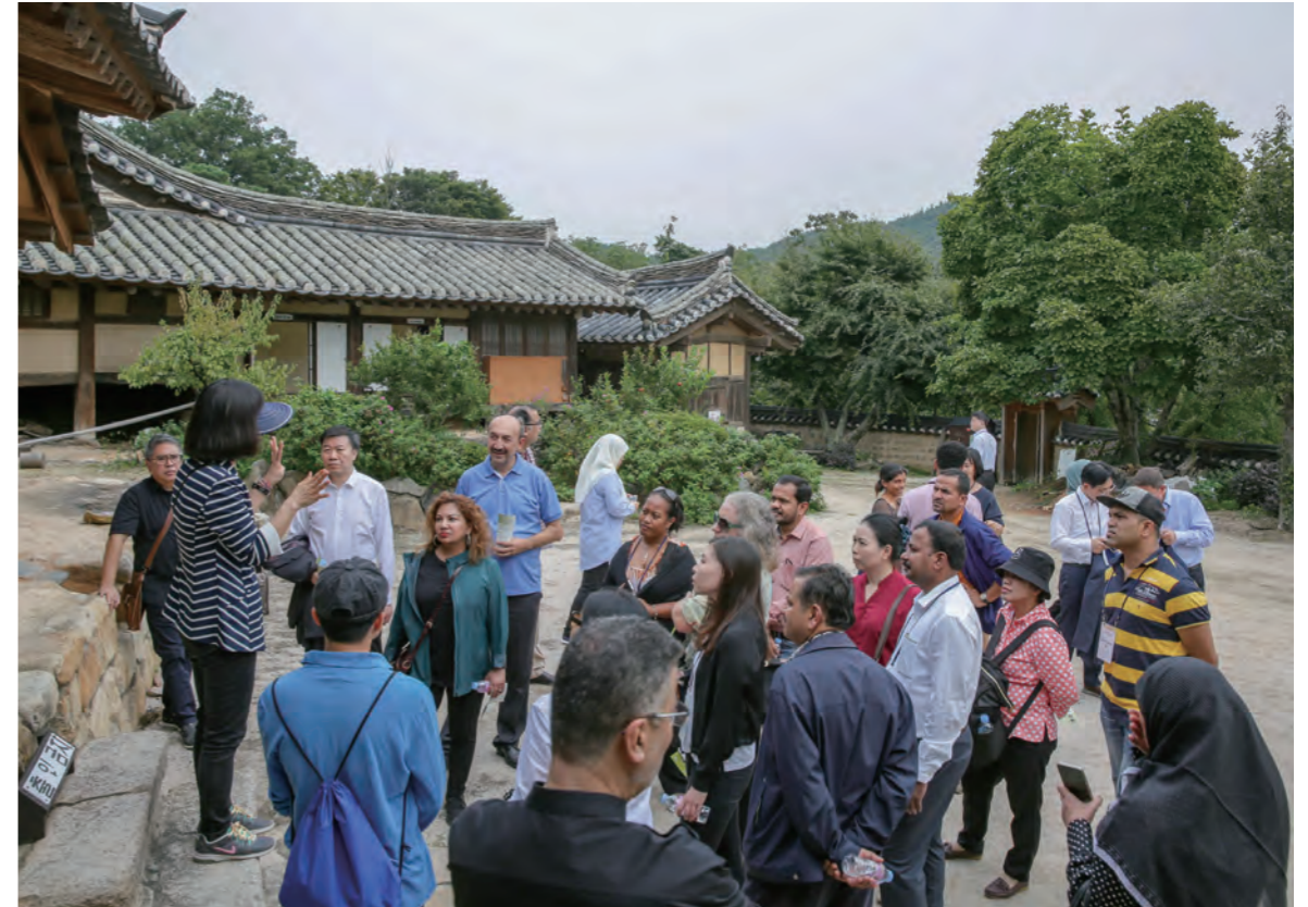
Participants listening to commentary at Yangdong Village