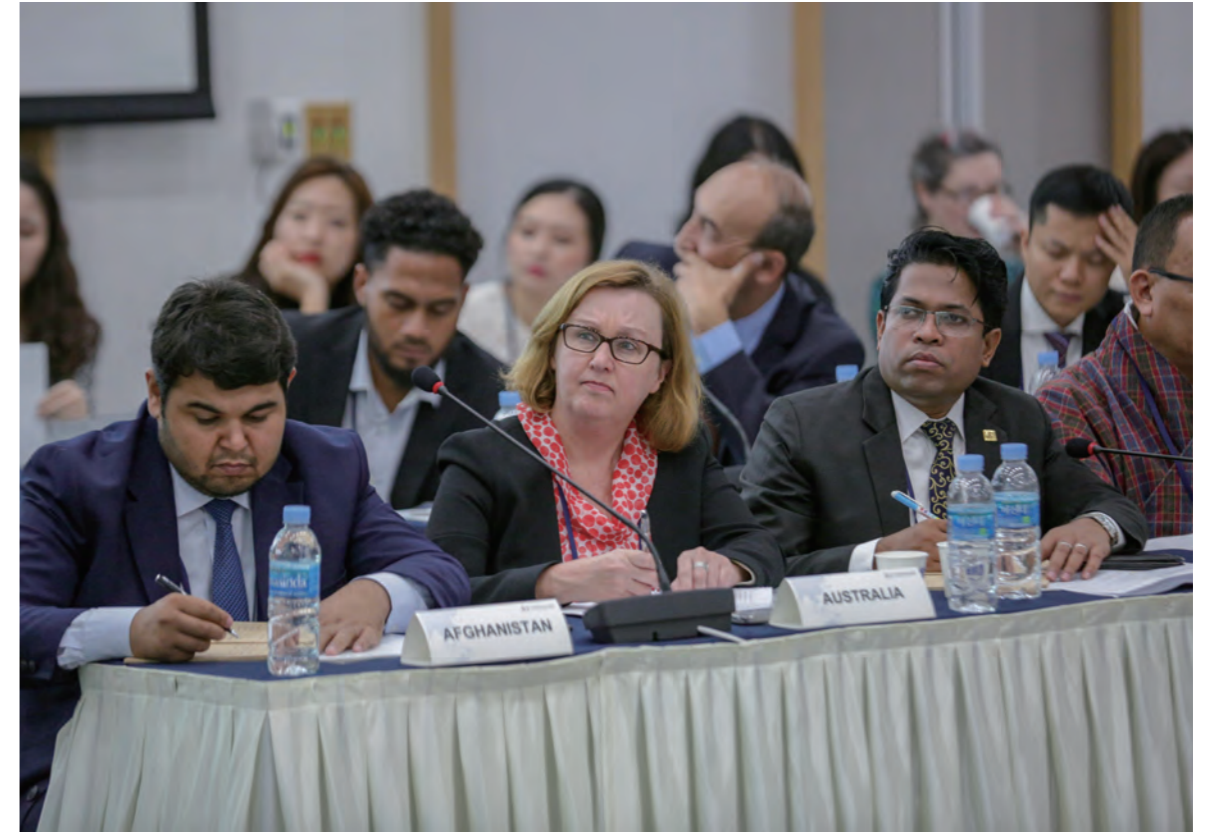
Participants listening to presentations