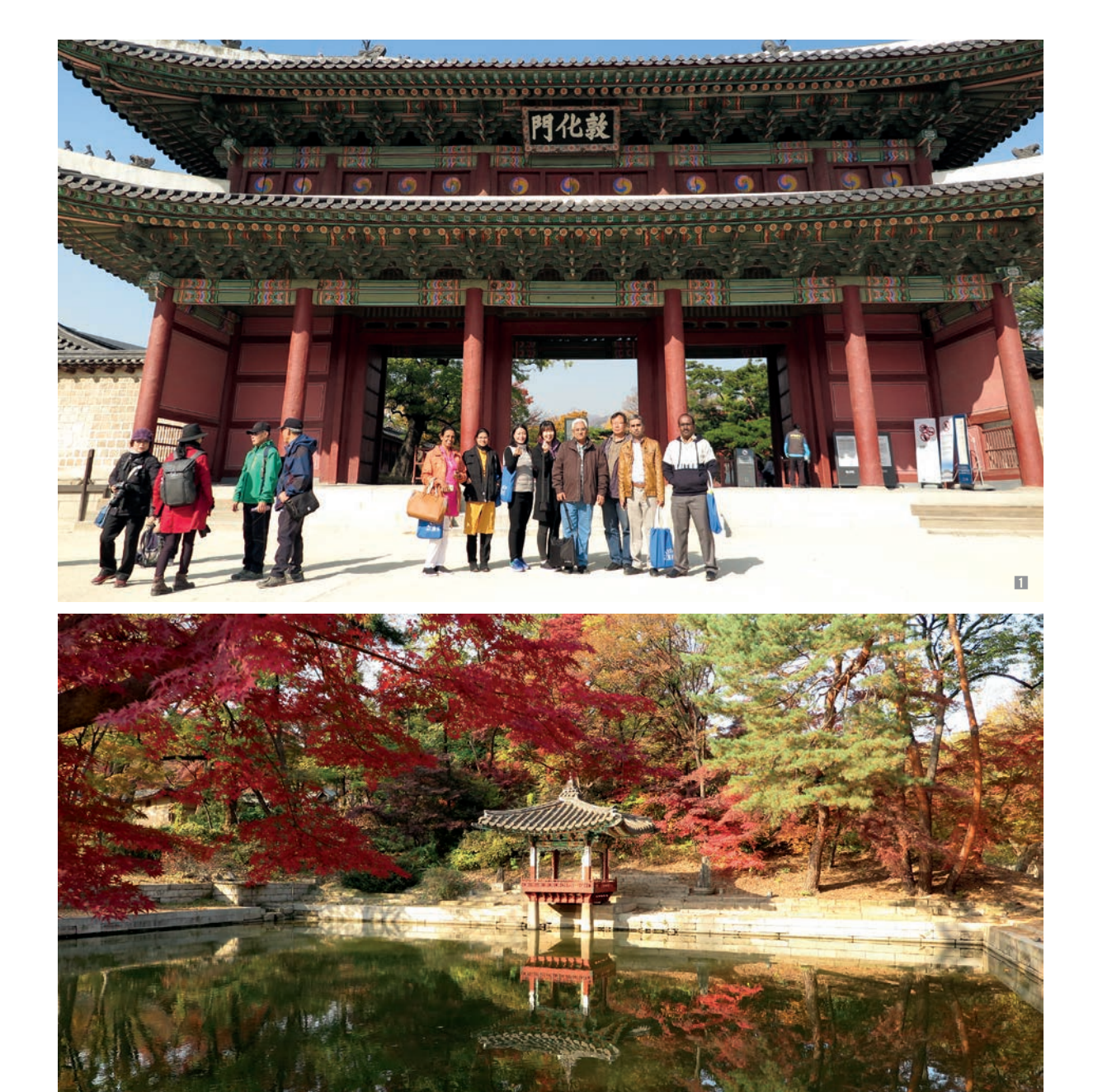
1 Participants in front of Changdeokgung Palace, 9 November, 2017

After the wrap-up session, the participants visited Changdeokgung Palace, a UNESCO World Heritage site located in Seoul, Republic of Korea. Changdeokgung is one of the principal palaces used by the kings during the Joseon Dynasty (1392–1897). This visit was prepared by KNCU as a cultural event for the participants.