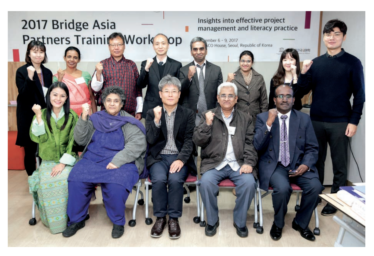
Group photo taken on Day 1, 6 November, 2017

Overall, the first day of the Workshop was a good start to this year's Workshop, helping to set participants' expectations. Participants expressed their hope that they could use the insights they had gained on Day 1 about each other's background to improve the implementation of their own projects in the future.