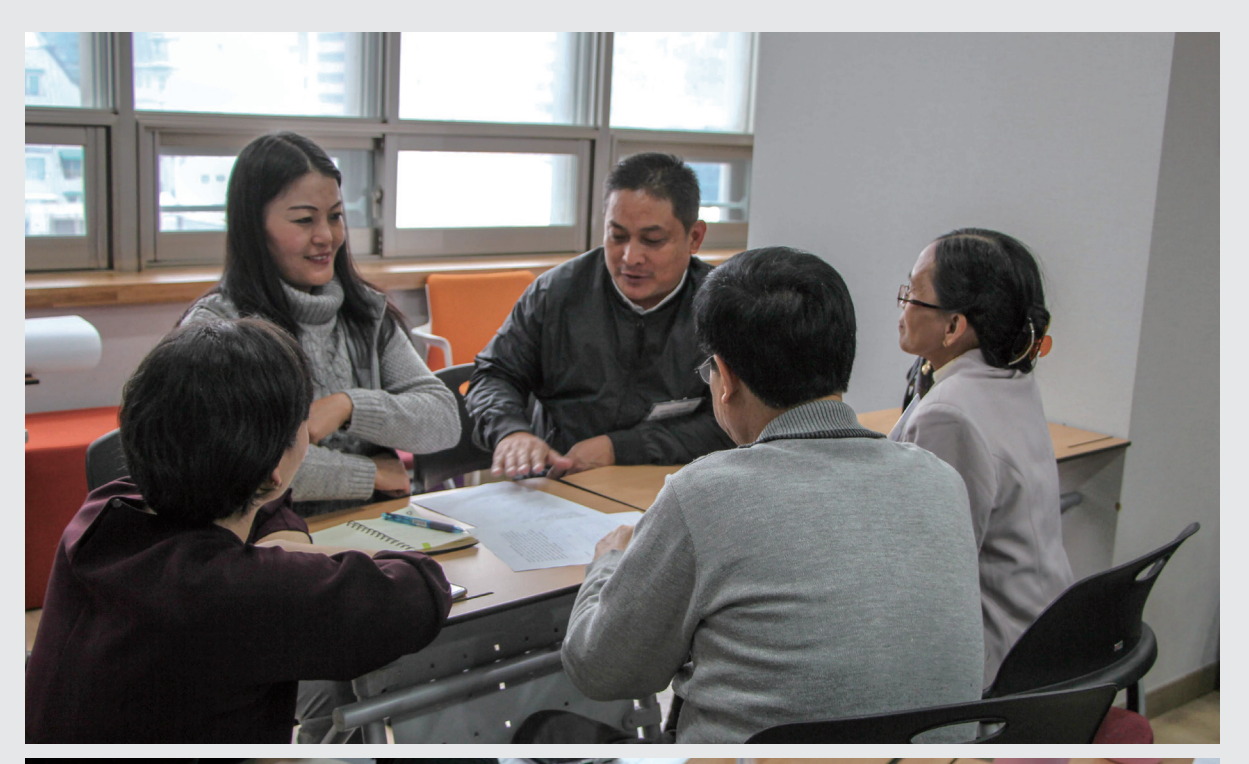
Participants, attending the workshop of Day 1, 6 November 2018