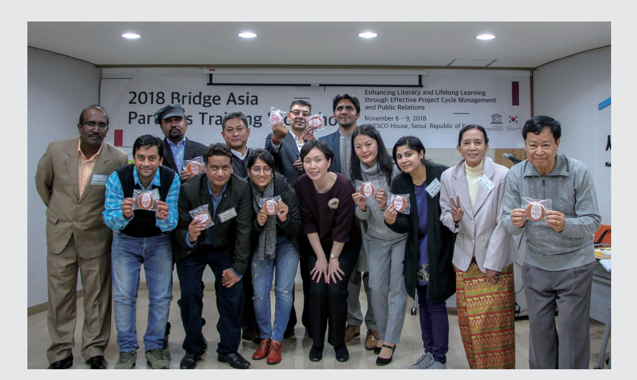
Group photo taken after the lecture on PCM, 7 November 2018