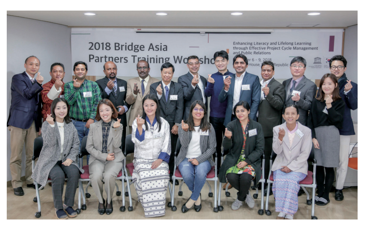
Group photo taken on Day 1, 6 November, 2018

The first day of the workshop allowed KNCU and all the participants to introduce themselves and give presentations on each partner country's non-formal education. Generally, each presentation gave an overview of the relevant country, an introduction to the partner organization in that country, the organization's ongoing activities, and the progress or achievement of each project, in particular the Bridge Asia project. Through the presentations, the participants learned more about other countries' contexts and the work and procedures of other governmental and non-governmental organizations.