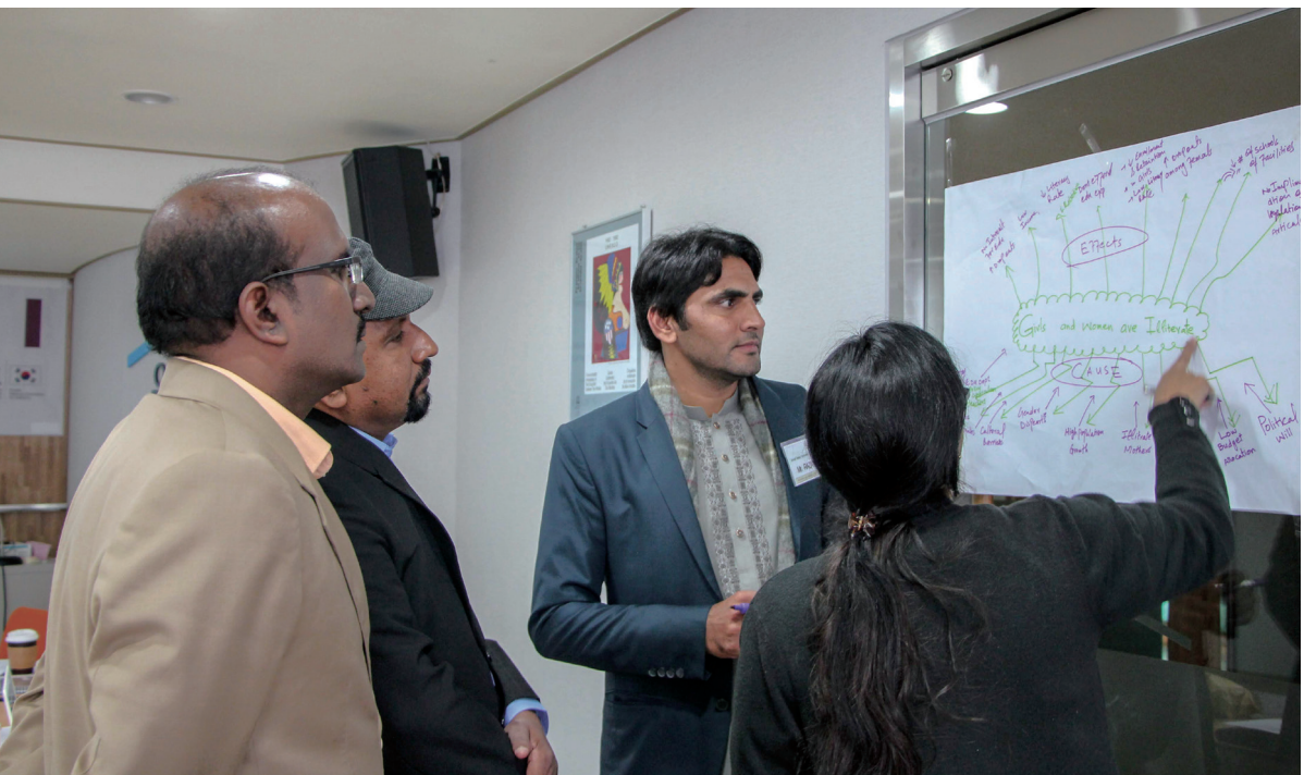
Participants drawing a problem tree on women's illiteracy, 7 November, 2018

A group of participants giving an explanation of their problem tree on women's illiteracy, 7 November, 2018