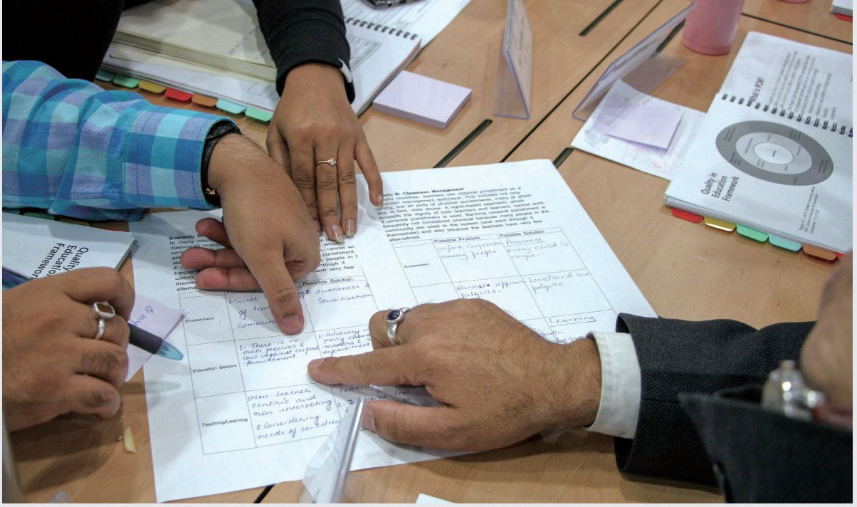
Participants having a discussion, 7 November 2018