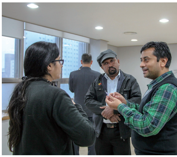
Participants making a video clip of a movie character, 8 November, 2018

Participants making a video clip using their mobile devices, 8 November, 2018